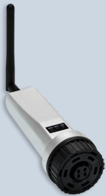
Data Logging Stick S3-WIFI-ST