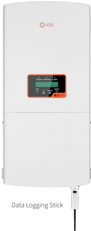
Data Logging Stick