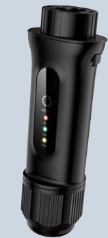
S2-WL-ST (4 Pin)