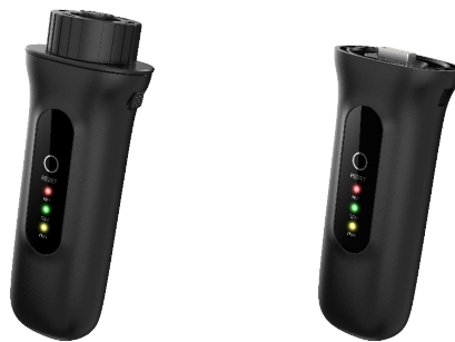
S1-W4G-ST (4 Pin)

>>> Use RS485 communication method to connect the inverters, up to 10 inverters can be connected at the same time. Data communication with the monitoring system through wireless WiFi network or 4G, which can realize remote control and monitoring. The network transmits intuitive data, which is convenient for customers to monitor anytime and anywhere.