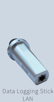
Data Logging Stick LAN