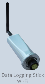
Data Logging Stick Wi-Fi