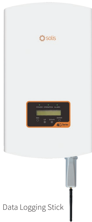
Data Logging Stick