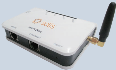
Data Logging Box DLB